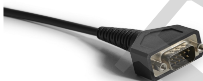
Figure 6: 9-pin D-SUB CAN connector.

The default option for the Kvaser U100 is the 9-pin D-SUB connector (see Figure 7) which has the pinout described in Table 7.