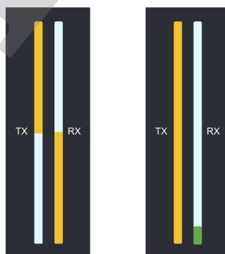
Figure 4: The total size of the LED Bars is proportional to the bus load. Both images indicate a bus load of 100%.