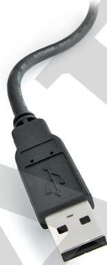
Figure 5: A standard USB type "A" connector.

The default option for the Kvaser U100 is a standard USB type "A" connector.