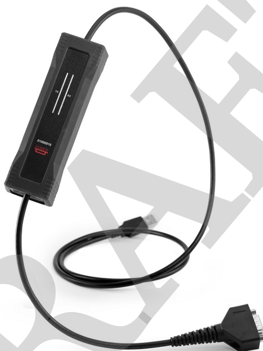
Figure 1: Kvaser U100 with D-SUB CAN connector

Kvaser U100 is a small, yet powerful, CAN to USB interface. It provides real-time transmission and reception of standard and extended CAN messages on the bus with a high timestamp precision, and is compatible with applications that use Kvaser's CANlib.